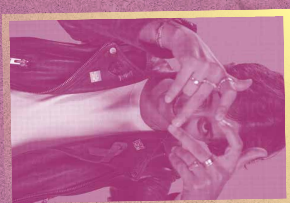
Biomesera a tutta