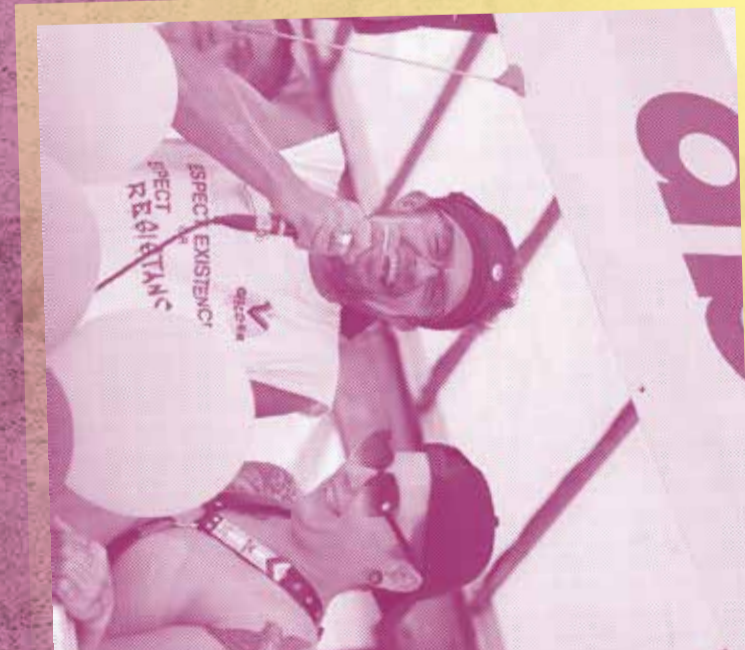
Someone who wasn't cisgender and straight was gay. That was a word thrown around the playground as an insult. Then 'lesbian', 'bisexual' and 'trans' became words that entered my world. A few years later, the word 'queer' came along. I found comfort in knowing that there were words I could connect to that describe people like me, but those words or a combination of them didn't fully define me. It was a nice feeling to know that there are enough people out there who feel the way I do, to have our own word!